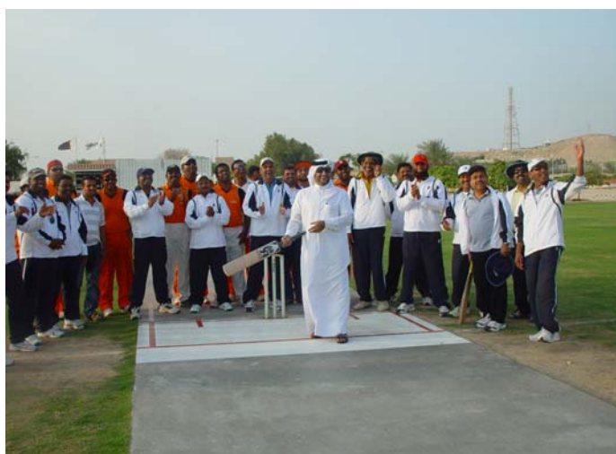
Nayef Saad Al-Kubaisi Opening the 6th Chairman's Cup Cricket Tournament 2010